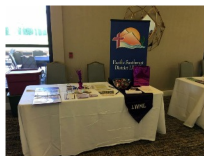
LWML Booth at the Pastor's Conference