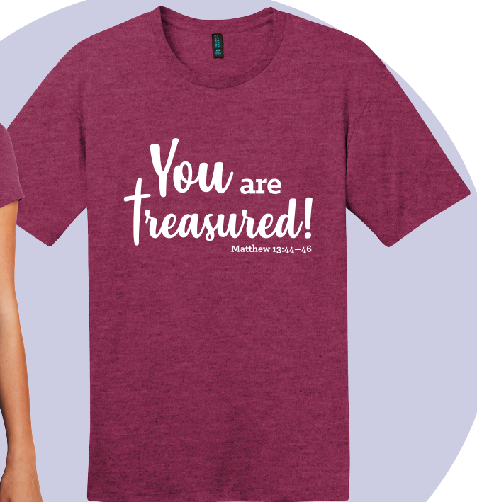
UNISEX CREW NECK

The feminine cut style runs significantly smaller. Consider ordering two sizes higher than your actual size.