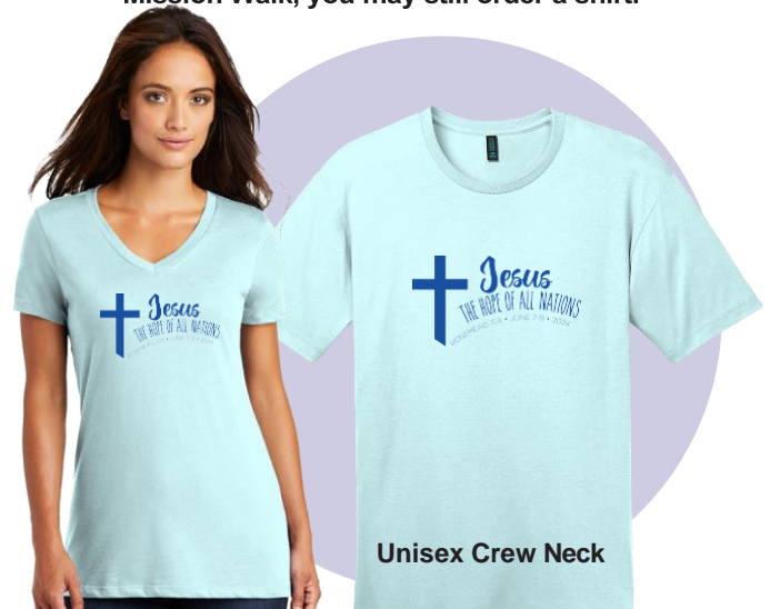
Unisex Crew Neck

If you do not intend to participate in the Mission Walk, you may still order a shirt.